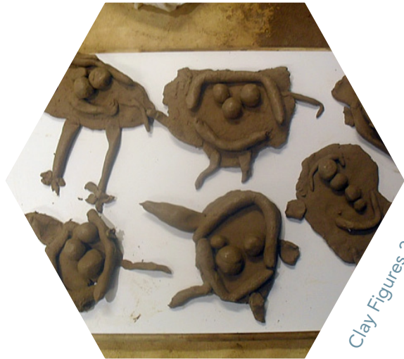
Clay Figures 2010